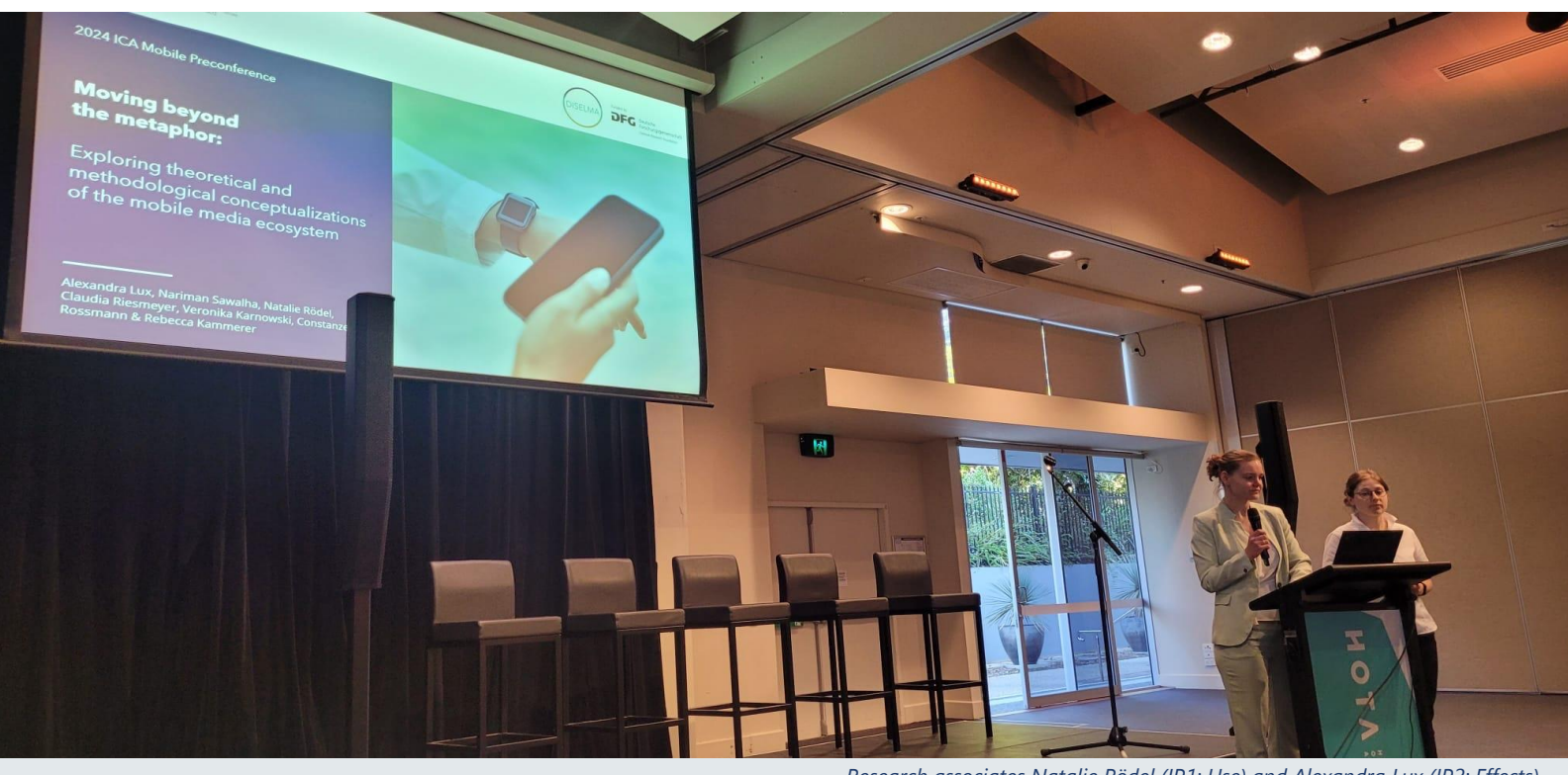
Research associates Natalie Rödel (IP1: Use) and Alexandra Lux (IP2: Effects)

The individual projects IP1: Use, IP2: Effects, and IP3: Healthcare jointly organized a workshop that aimed to go beyond the mere metaphorical use of the term "Mobile Media Ecosystem". Together with engaged participants we discussed and explored different understandings and conceptualizations using mobile self-management of chronic diseases as an example. We were rewarded with great interest in the topic, lively participation, and valuable contributions that deepened our understanding of the subject from different scholarly perspectives.